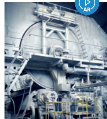
ANDRITZ high-performance PrimeDry Steel Yankees are made entirely of steel, contributing to enhanced safety and 8 – 10% better machine performance when compared to a cast Yankee.