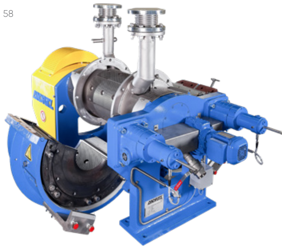
ANDRITZ Papillon refiner with its compact cylindrical rotor design

and allow for fast grade changes on the machine. For refining, the Papillon refiner has a compact cylindrical rotor design. Energy savings can be quite significant when compared to competitive refiners, and the fiber is properly treated over the entire refining area.